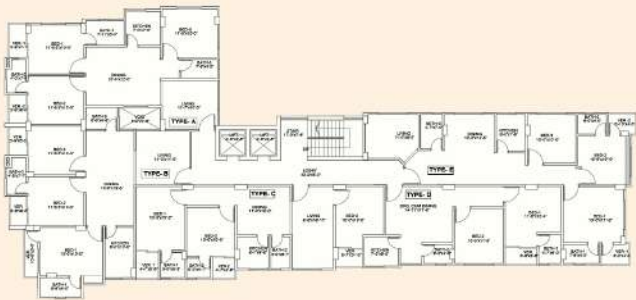
N 1ST TO 9TH FLOOR PLAN SCALE