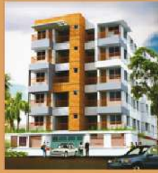
DISHARI MOMTAZVILLA 25/12 Rupnagor Residential Area