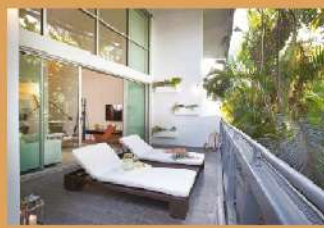
DISHARI MOON VILLA 25/20 Rupnagor Residential Area.