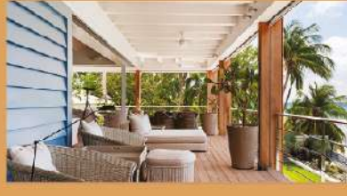
DISHARI KHAN VILLA 26/16 Rupnagor Residential Area.