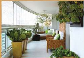
DISHARI MORNING SUN 29/38 Rupnagor Residential Area.