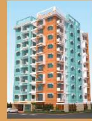
MATRICHAYA SHANTI NIBAS Rahman Nagor, Uttara, Dhaka