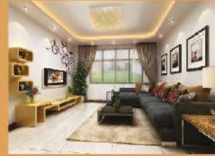
DISHARI ZOHA VILLA 26/18 Rupnagor Residential Area.