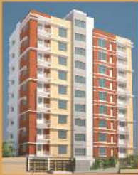
MATRICHAYA BAGAN BILAS Bhasantek, Cantonment, Dhaka-1206