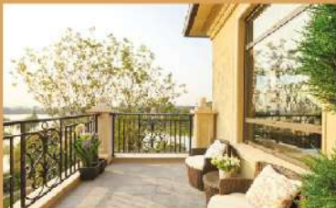
DISHARI ZANITH VILLA 26/25 Rupnagor Residential Area.